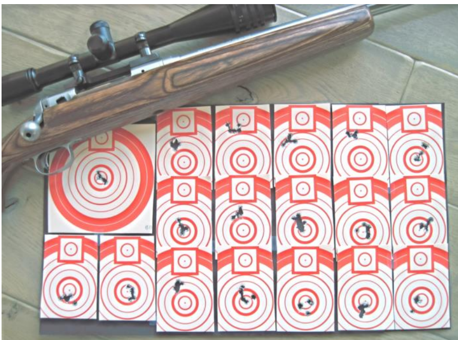
5-round 100 yard groups using cast bullets

Misconception #2 "the fastest velocity is the most accurate". Many people have convinced themselves, through exhaustive testing, that the fastest muzzle velocity is seldom the most accurate. I proved that to myself with quite a few guns and a chronograph.