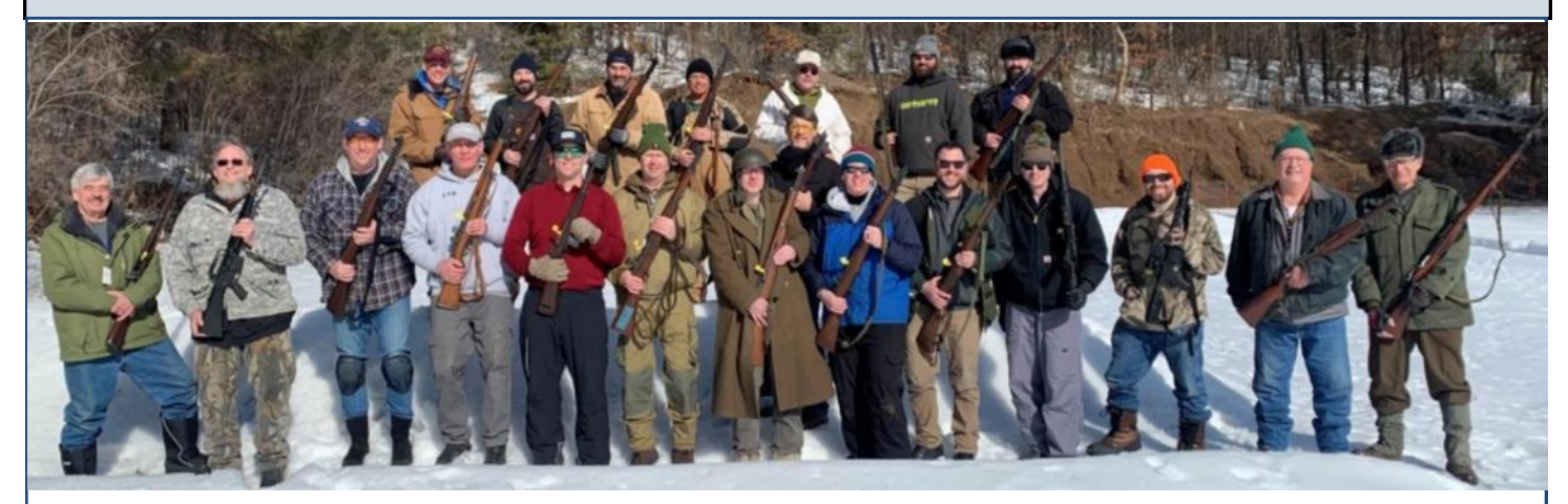
19th annual Frozen Chosen match on Feb 18