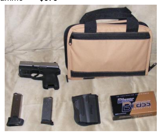
Sig Sauer 290 RS, night sights and laser sight, 2 mags, holster, pistol rug, and 1 box ammo. Very low rounds (under 150) $550