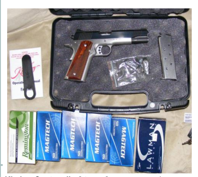
Kimber Custom II - 2 tone, 2 mags, manual, case, ammo can, 600 rds ammo, 45 ACP, low rounds $1125