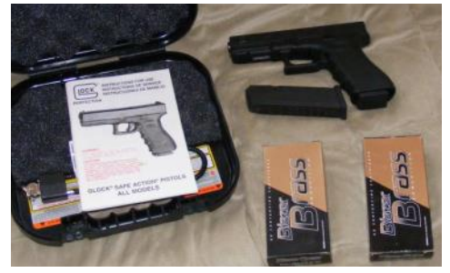
Glock 17 Gen3 - 2 mags, lock, case and 100 rds ammo $575