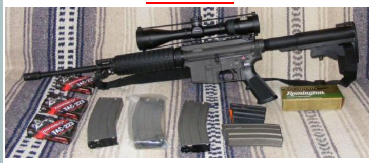
<u>Bushmaster AR-15</u> - case, 5 mags, manual Nikon P-223 scope, ammo can, 550 rds 223 $1175