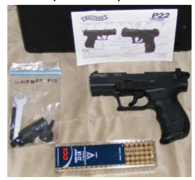
Walther P22, extra front sights and grip palm swells, lock, 100 rounds ammo. Low rounds (under 300) $375