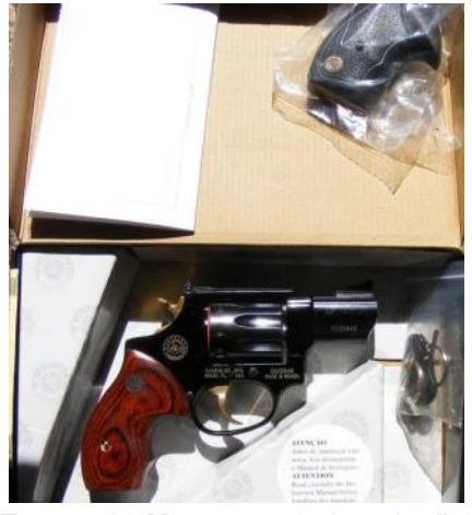
Taurus 22 Magnum - 8 shot ultralight, 2 sets of grips, Cabela's exclusive Model 941, adjustable rear sight, 50 rds ammo $450