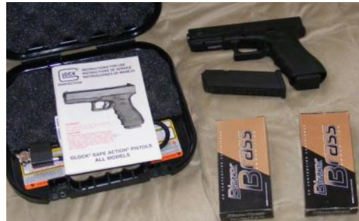
Glock 17 Gen3 - 2 mags, lock, case and 100 rds ammo $575