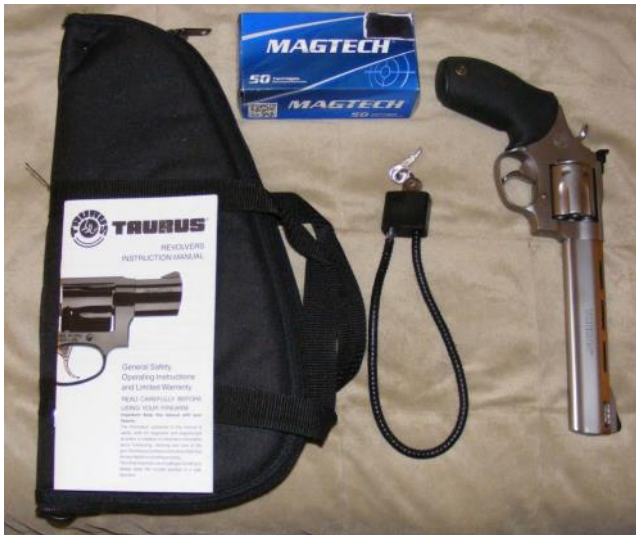
Taurus Tracker, 6-1/2" ported barrel, 7 rd cap, low rounds (less than 300), pistol rug, lock, 1 box ammo 158 gr SJSP Flat $475