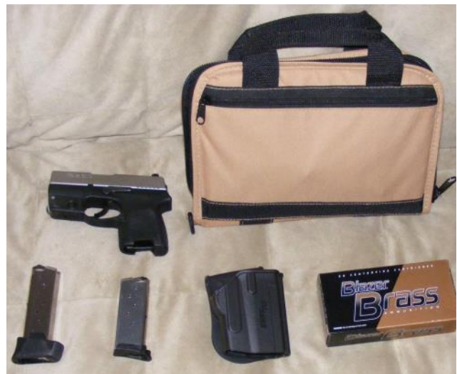
Sig Sauer 290 RS , night sights and laser sight, 2 mags, holster, pistol rug, and 1 box ammo. Very low rounds (under 150) $550