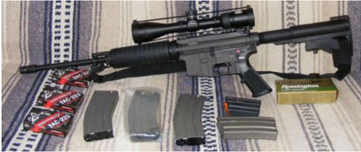
Bushmaster AR-15 - case, 5 mags, manual Nikon P-223 scope, ammo can, 550 rds 223 $1175