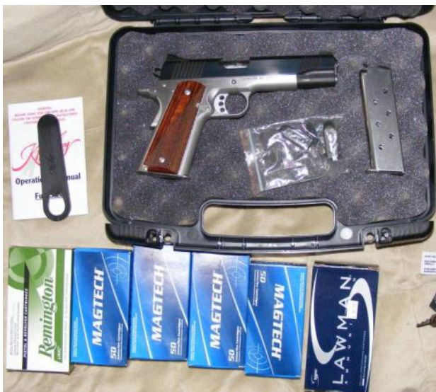
Kimber Custom II - 2 tone, 2 mags, manual, case, ammo can, 600 rds ammo, 45 ACP, low rounds $1125