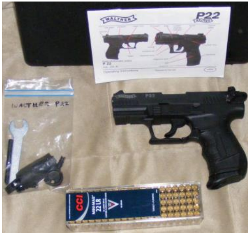
Walther P22, extra front sights and grip palm swells, lock, 100 rounds ammo. Low rounds (under 300) $375