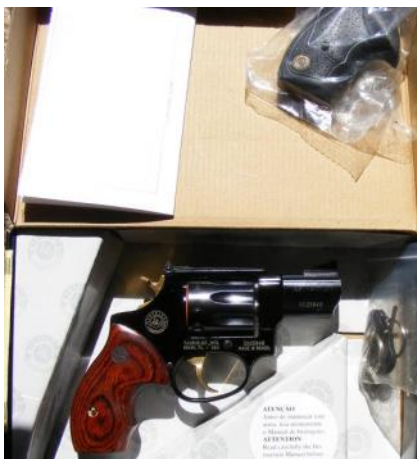
Taurus 22 Magnum - 8 shot ultralight, 2 sets of grips, Cabela's exclusive Model 941, adjustable rear sight, 50 rds ammo $450