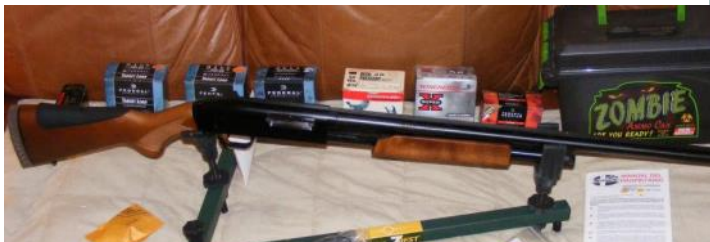
Mossberg 500, 28" barrel, only fired once, case, lock, ammo can, 2 boxes 25 rds #5, 1 box 20 rds #6, 1 box 25 rds #6 steel, 1 box 10 rds 3" #6, 1 box 10 rds 2-3/4" #5 $350