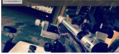
American Rimfire Association

Looking for parties interested in participating in an ARA (American Rimfire Association) bench rest match program at the club. Interested members with experience running official matches would also be helpful. Participants would be firing .22 bolt action rifles' with scopes from 50 yards. Each match lasts 25 min. and utilizes a sheet of 25 separate targets. See example below. See more info on the ARA at: American Rimfire Association We can establish this as an official match or just a fun after work informal league. With the ammo situation these days, .22 is a fun cheap option to still get out and do some shooting.