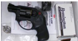
Ruger LCR 38 Special + P - 50 rds 38 ammo, low rounds $450