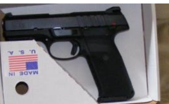
Ruger SR9e - NIB, 50 rds 9MM $425