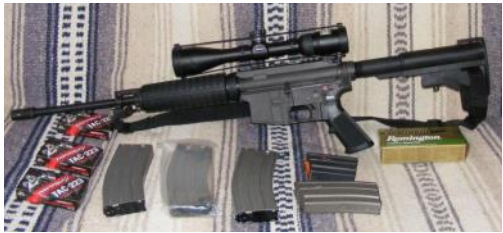
Bushmaster AR-15 - case, 5 mags, manual Nikon P-223 scope, 300 rds 223 $995