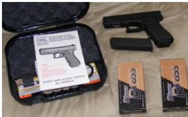
Glock 17 Gen3 - 2 mags, lock, case and 100 rds ammo $575