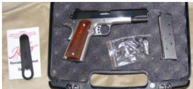
Kimber Custom II - 2 tone, 2 mags, manual, case, 300 rds ammo, 45 ACP $895