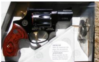
Taurus 22 Magnum - 8 shot ultralight, 2 sets of grips, Cabela's exclusive Model 941, adjustable rear sight, 50 rds ammo $450